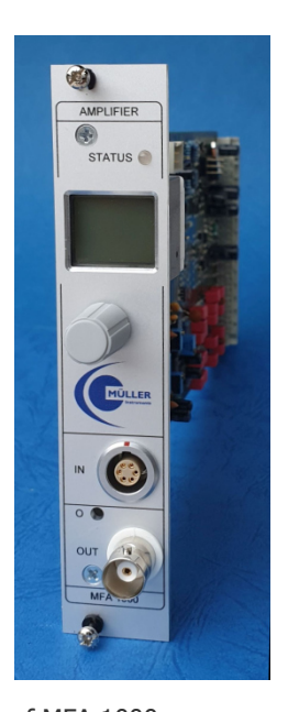
Front and Back side of MFA 1000 incl. power supply (3rd Generation)