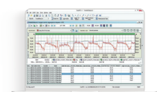
SvanPC++ EM Post-processing software