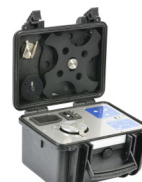
SV 111 Vibration Calibrator