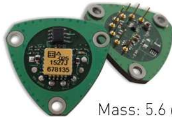
Mass: 5.6 grams

Pin and Form Factor Compatible with Industry- Standard Quartz Accelerometers