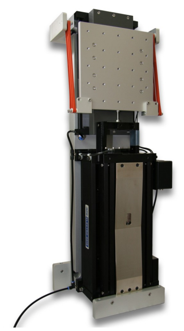
APS 129 with APS 1291 - Vertical Mounting Kit

All features of the basic APS 129 ELECTRO-SEIS® shaker are retained. The drive coil is made for 40 % increase in force with a 50 % duty cycle (30 min cycle).